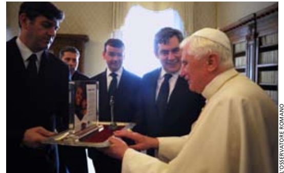
Pope Benedict XVI receives the IFFIm gift from British Prime Minister Gordon Brown

Baby Brucktayet had just received a pentavalent vaccination against diphtheria, pertussis, tetanus, Hepatitis B and Haemophilus influenzae type B or Hib provided by the GAVI Alliance using funds raised by IFFIm.